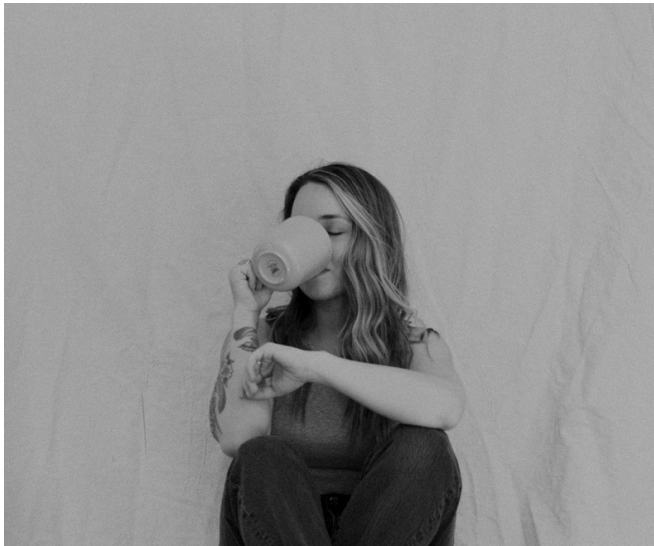
PHOTOGRAPHER . VIDEOGRAPHER , LOVER OF ALL THINGS LOVE